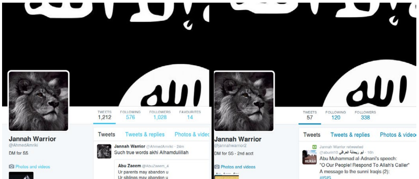
Figure 1. An illustrative example from our data of two resurgent accounts which we classified as a set. They have almost identical handles and almost identical biographies. Their images were not inspected, but their profile images are an almost identical match too. Screenshots of two user accounts taken from http://twitter.com .

When comparing accounts, we used open criteria for determining whether they formed a set. However, in practically all cases, an almost identical match between handle, name, biography or location was necessary and sufficient. Biography and handle were the strongest indicators, whilst location, surprisingly, was still informative due to peoples' unique spelling, punctuation, and choice of descriptive terms. A hypothetical, illustrative example of an almost identical match would be the handles “@jihad_bob2” and “@jihad_bob3”.