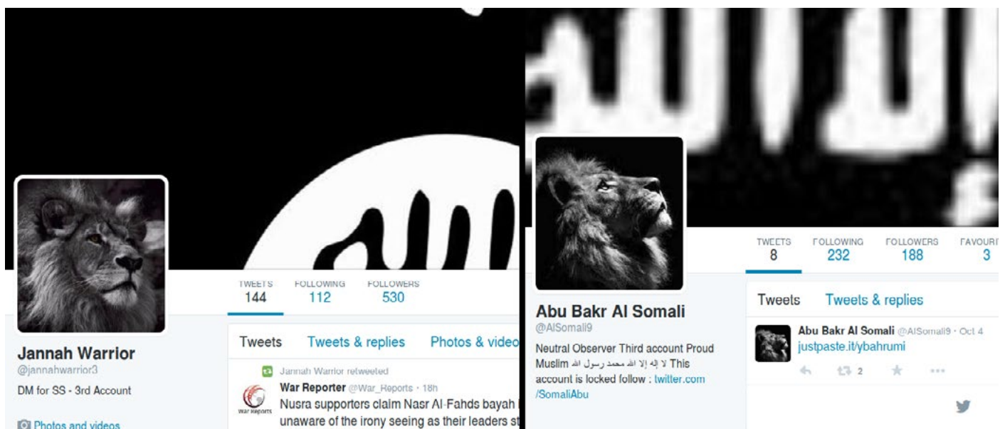
Figure 2. An illustrative example from our data of two accounts which we did not classify as duplicates of one another, despite some similarities. Screenshots of two user accounts taken from http://twitter.com .