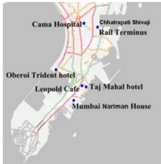
Figure 2: Locations of 26/11 Mumbai terror attacks

10 militants carried out the Mumbai terror attack. Each member of the team was given rigorous training. They entered Mumbai clandestinely using a stolen boat, travelling all the way from Karachi by sea. They were equipped with sophisticated weapons and navigation equipment like Global Positioning Systems (GPS) and satellite phones. After reaching the territorial waters of Mumbai, they divided themselves into five groups and captured the high profile five stars Taj Mahal Hotel, on the Gateway of India, the Oberoi Trident Hotel, Café Leopold, Chhatrapati Shivaji Terminus and the Nariman (Chabad) house Jewish community centre. The various locations of the attack are shown in the Figure 2.