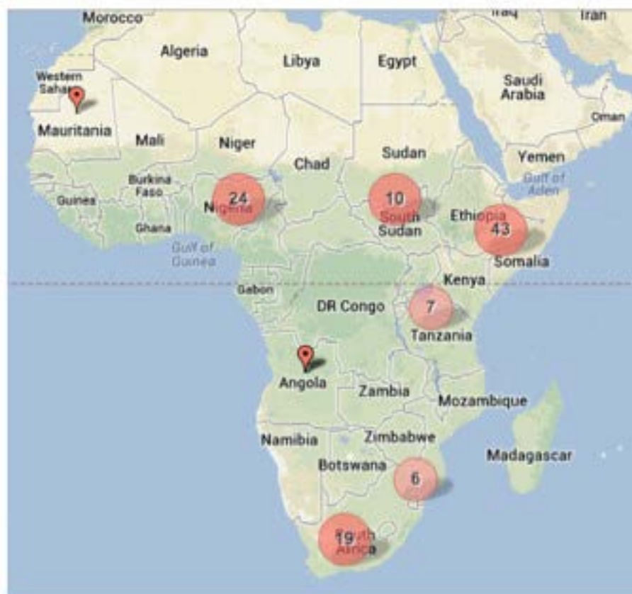
Figure 4: Regional geographic clustering of terrorist groups with an identified web presence

sites across the Sub Saharan African region. Shown below in figure 4, is a visualization of the distribution of terrorist website in the region (distribution in this case is not based on the location of the server hosting the site but on the physical location of the terrorist group related to the web site)